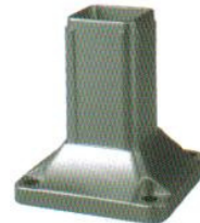
Four Hole Base (FPB4)

For all surface mounting applications a post base with four fixing holes is available; this is ideal when attaching your posts onto areas such as decking, courtyards or retaining walls. A single hole base is also available for use with the in-ground posts, this base is fixed onto the post and then concreted into the ground to add extra strength, however this is not a necessity.