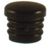
Plastic Cap (FCPC)

**Additional non stocked fence caps are available. Please check with your local fabricator or Fabtech for details.