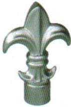
J Female (FCJF)

You have the option of two spears, an aluminium cap or an economic plastic cap for the top of the verticals on your fence panels. Aluminium Spears and caps can be powder coated to match the colour of your fence panel. Note: The plastic capping comes standard in black and cannot be powder coated.