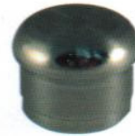
Aluminium Cap (FCAC)