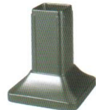
Single Hole Base (FPB1)

****Additional bases are available for different applications such as wall, or sideways mounting. Please check with your local fabricator or Fabtech for details.